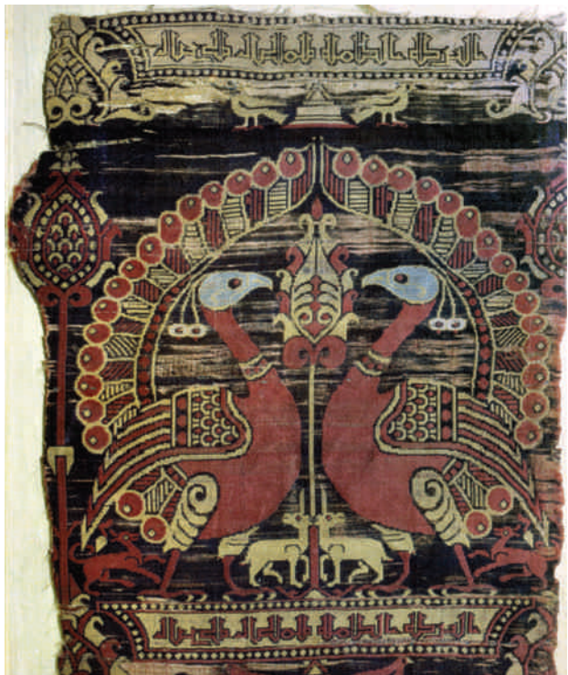
V&amp;A Images/Victoria &amp; Albert Museum

Spanish Muslim Textile of the Twelfth Century This fragment of woven silk, featuring peacocks and Arabic writing, is one of the finest examples of Islamic weaving. The cotton industry flourished in the early Islamic centuries, but silk remained a highly valued product. Some fabrics were treasured in Christian Europe.